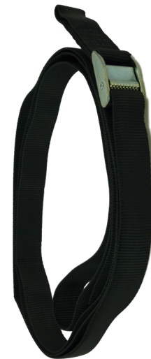
Adjustable Hanging Strap